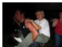
Taking a Lift