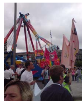
Taking in the atmosphere