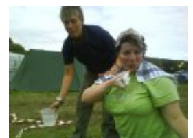
A girl needs to wash her hair