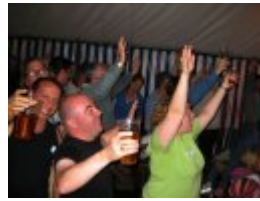
Beer & Hymns

One of the best memories comes from the beer and hymns night – never have I been in a place when rousing choruses, Christian messages and pints thrust high have been combined with such an amazing crowd – its no wonder people were packed in there!