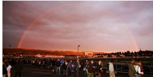
A full rainbow appears over Greenbelt

It was the 37th year since Greenbelt was founded and this year's theme was 'The Art of Looking Sideways'. Greenbelt is a annual Christian festival of music, arts, talks and worship. Christians come from all over the country to be amused, challenged, have fun and fellowship and well, just express their love of God. It is why I look forward to it so much and I know many others do too.