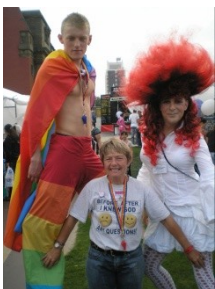
Me & 2 tall gay guys