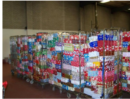
Boxes waiting to be checked