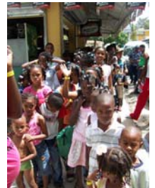
The children queue up

When we set out on a journey that none of us knew what to expect, the things that we expected to find hard such as drug dealing and prostitution weren't so hard to deal with or face, it was the poverty, children not having food, water and medical care. It was also hard to watch open injustice and often sights of guns and violence. The Dominican Republic is beautiful like many other Caribbean countries and it sounds like it was all fun but in the beauty there are dark shadows.