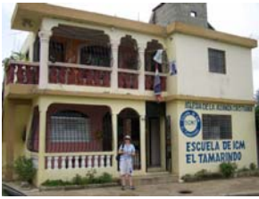
MCC School of El Tamarindo.