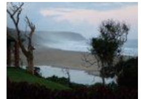
The scenic landscape

My time here now seems to be passing quickly, and I am looking forward to a happy re-union with you all in January!