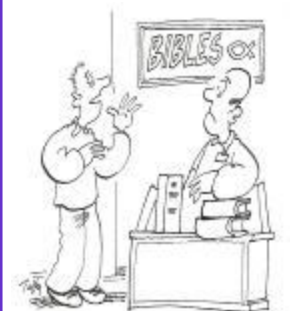
...prithce brother, just thow a versian which I mightest verify understand?