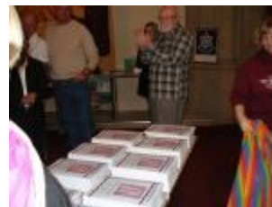
The books are uncovered