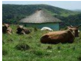
Every day life in Africa

Before I left, I had decided that I would bring the Anglican lectionary with me, so I would have a structured way of reading the Bible every day. On the day that I left, when I was feeling incredibly anxious, the Psalm for the day was Psalm 31 . Listen to this for someone in my predicament;