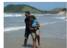
and having a laugh